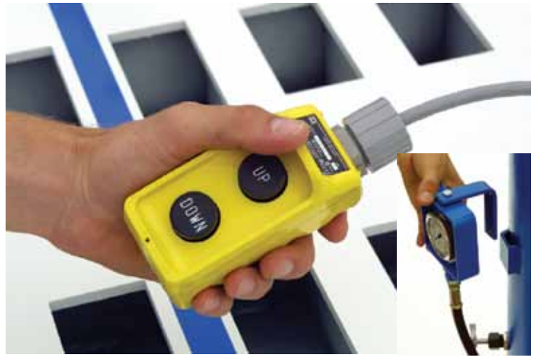
One control for hydraulic pump operation. Each tower has it's own hydraulic gauge and valve control.