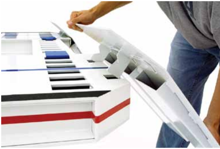
Strong, portable removable ramps.