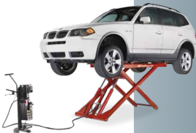
Model#: MR6 Portable Mid-Rise Lift 6,000 lb. capacity

Exclusive features include a sliding/rotating arm design with rubber pads, low drive-over clearance, and much more.