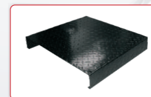
Optional length extension kit Adds an extra 15 3/4" (400mm) length to the platform for long axle vehicles. Kit No.: MC002