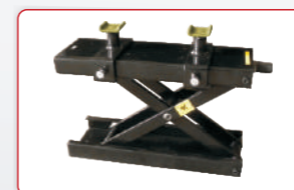
Optional lifting jack Lifting capacity: 1,100 lbs (500kg). Perfect for wheel removal. Kit No.: MC005