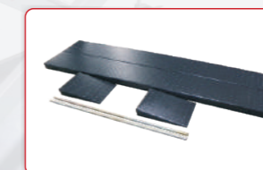
Optional width extension kit Adds an extra width of 23 5/8" (600mm) to the platform to accommodate three or four-wheel ATV's. Kit No.: MC002