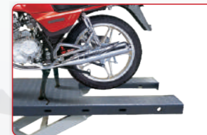
Rear tire removal cover Removable platform cover plate is convenient for rear wheel changing.