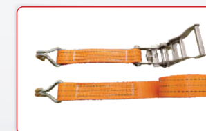
Vehicle tightening belt Secures the motorcycle before lifting. Ships standard. Kit No.: 720014