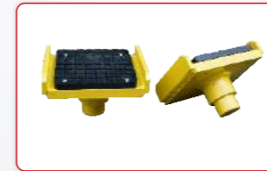
Optional saddle adapter. Kits No.:21103 (heavy-duty truck)

The chain protection cover prevents the chain from slipping off.