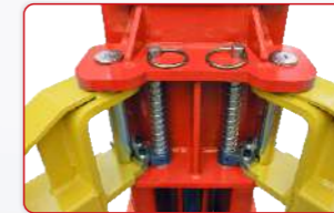
Automatic arms restraints and release.