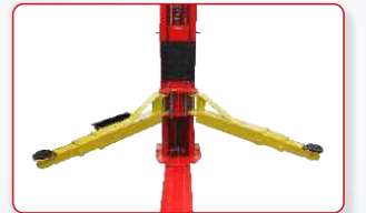
4 three-stage arms are suitable for more vehicles.