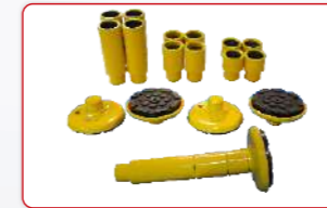
The stackable rubber pads package with 1.5", 2.5", 5" extension adapters.