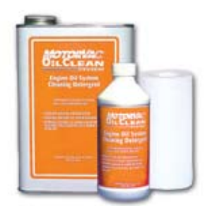
Part# 200-1026 The OilClean Service Kit includes specifically formulated solutions for the OilClean 1000 that can also be safely used in other oil exchange machines.