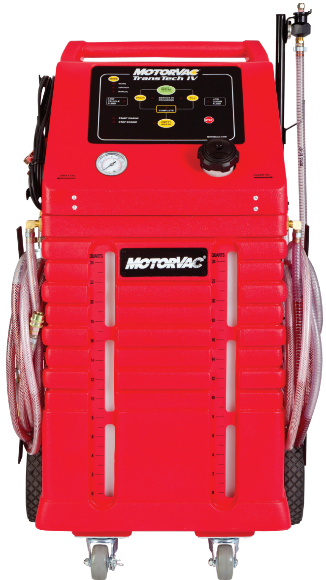
Part No. 500-1125

Dipstick Exchange - TransTech IV features a convenient Dipstick option that allows an effective ATF exchange through the transmission dipstick tube. This useful alternative is suitable when cooler lines are corroded or difficult to access.